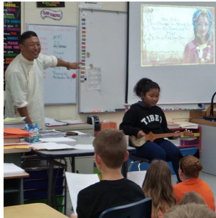
Photo Left: One of our students along with a staff member perform traditional Tibetan music for our 4th grade!